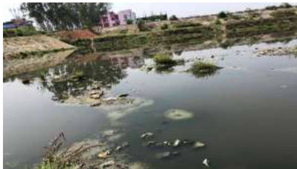
Fig. 1:- Collection of wastewater near Roorkee city.

For this study raw wastewater was collected from the four different sites of Roorkee viz. Civil line (near kathi roll) Fast food cuisine, Chaupati (civil line), B.T. Ganj and Sonali Bridge (near CCD, Café, Coffee Day). Algae were ( Chlorella vulgaris and Hydrodictyon reticulatum ) collected from the Roorkee and Haridwar region near the Ganga Canal. Both the cultures were incubated at 25°C at constant temperature and continuous light exposure of 5,000 lux for 14 days in Environmental Engineering Laboratory, COER. All the Physicochemical parameters (pH, Turbidity, BOD, Total hardness, Alkalinity and Acidity) of waste water were analyzed in the laboratory on the same day (Trivedi, and Goel 1986). Whereas with algal samples (50g/l) waste water were analyzed after 14 days of biosorption process The study was conducted using raw wastewater for 14 days at raw waste water pH, constant temperature 25 \pm 1^\circ\text{C} , and at constant light intensity ( 100 \mu\text{E}/\text{m}^2/\text{sec} ).