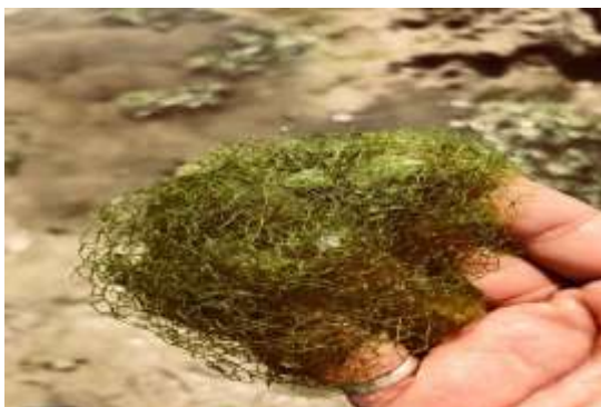
Fig 2:- Collection of algae near Haridwar.

Chlorella vulgaris Chlorella vulgaris is a eukaryotic, unicellular green alga. It is a genus of single-cell green algae belonging to the family Chlorophyte. It contains green photosynthetic pigments chlorophyll a and b in its chloroplast. Throughout photosynthesis, it multiplies swiftly, requiring only \text{CO}_2 , water, sunlight, and a little amount of minerals to reproduce. It is a possible food source since it is high in protein and other essential nutrients; when dried, whereas 45% of protein, 20% of fat, 20% of carbohydrate, 5% of fibre, and 10% of minerals and vitamins.