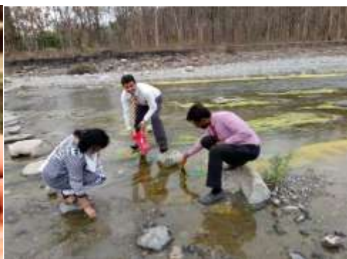
Fig 3:- Hydrodictyon reticulatum .