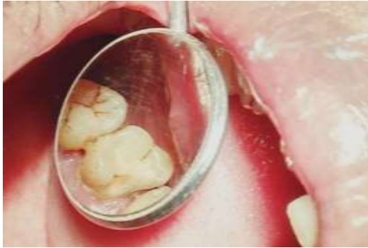
Fig 1:- Fractured cusp.