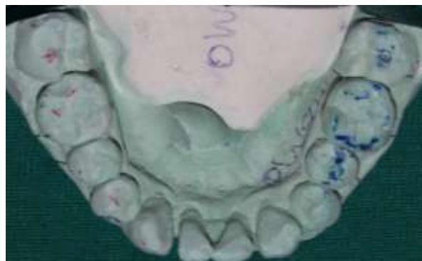
Fig 4:- Mandibular cast.