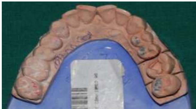
Fig 3: Maxillary cast.