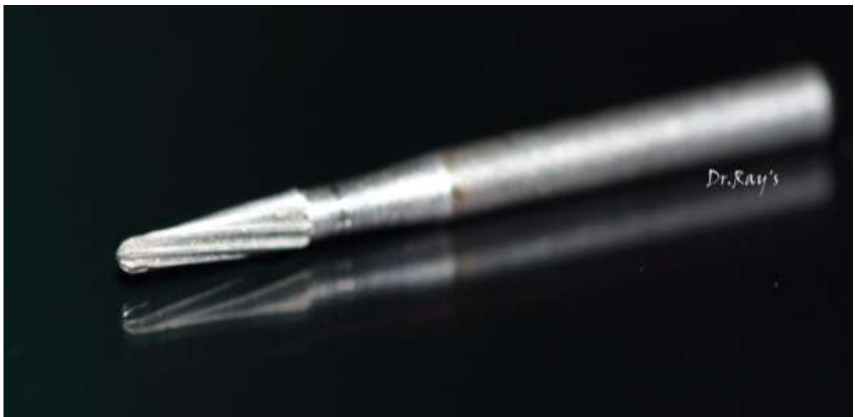
Fig 6:- (a) No.169L carbide bur, Burs and materials used.