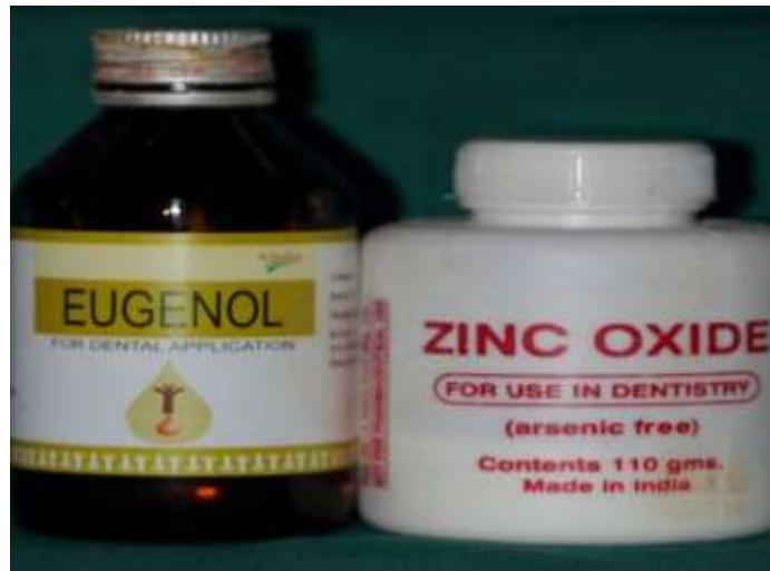
Fig 6: (d) Zinc Oxide Eugenol Cement.