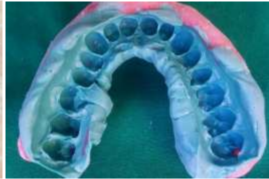
Fig 2:- Polyether impression.