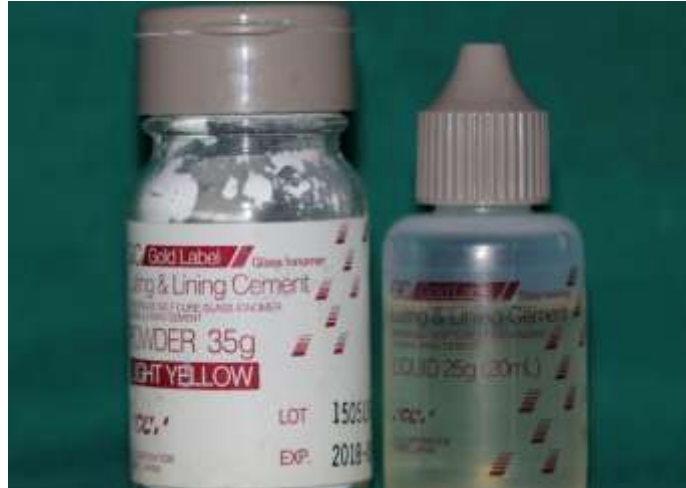
Fig 6: (c) Glass Ionomer Cement