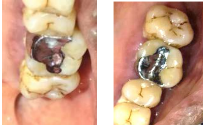
Fig 5:- (c) Post-operative photograph of 26 with the cemented inlay.