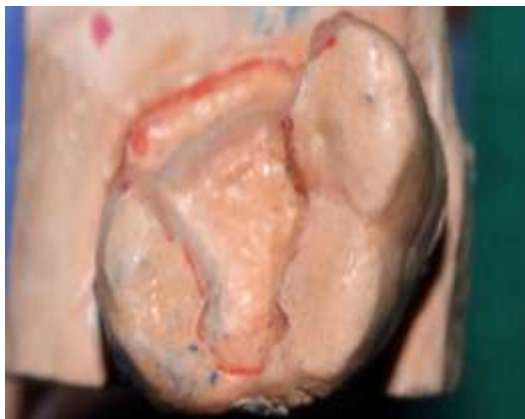
Fig 5:- (a) Die in occlusal view.