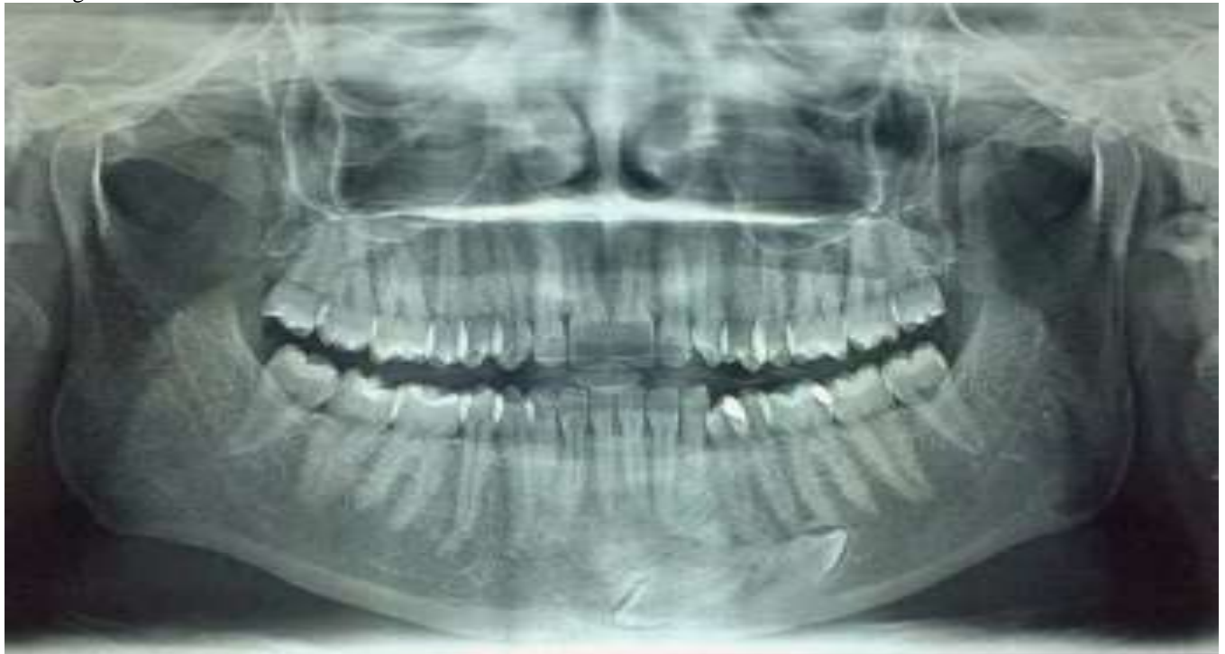
Figure 1:- Orthopantomogram showing the transmigrated canine.

Panoramic radiograph revealed impacted mandibular right and left canines. However, the right canine not only crossed the midline but also "Crossing over" the existing impacted left canine was evident. Cone beam computed tomography (CBCT) was done and it was noted that the transmigrated canine also brought about changes in the morphology of the inferior alveolar canal of the left side. Bony changes were also seen at the coronal aspect of the transmigrated canine.