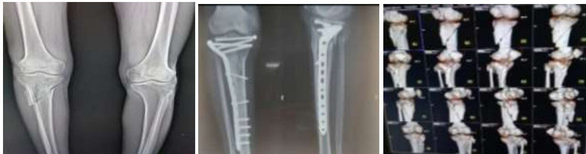
PRE OP XRAY