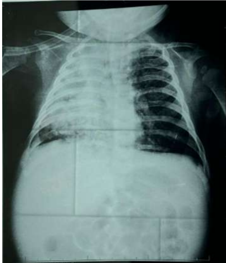
Figure 2: Frontal chest X-ray showing a “white lung” suggestive of massive alveolar syndrome.

inserted, allowing drainage of 100 to 200 cc per day. Management also included anti-oedematous measures, including sedation and mannitol administration to limit cerebral involvement.