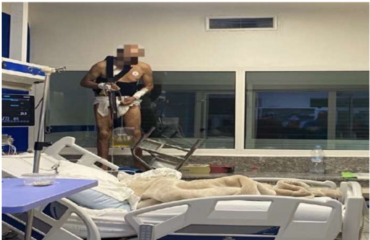
Figure 2:- Practical Example Illustrating the Necessity of Physical Restraint in Critical Care.

35% of physicians and 25% of nurses cite staff shortages and the inability to provide continuous monitoring as a contributing factor.