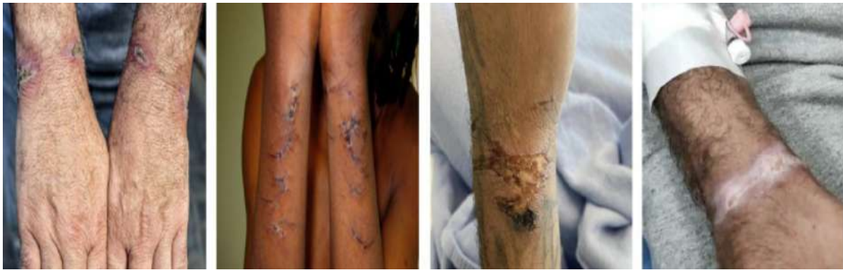
Figure 3:- Skin Injuries due to the use of Hand Cuffs.

14% of physicians cite severe complications (sepsis, hypercatabolic syndrome) linked to prolonged stress and immobilization.