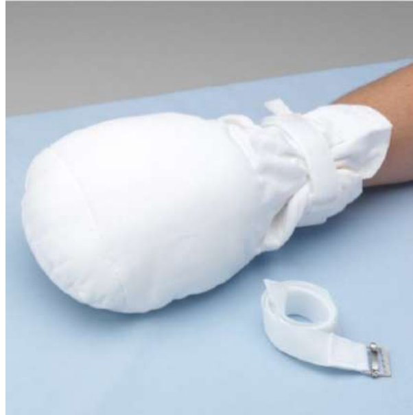
Figure 4:- Mittens.