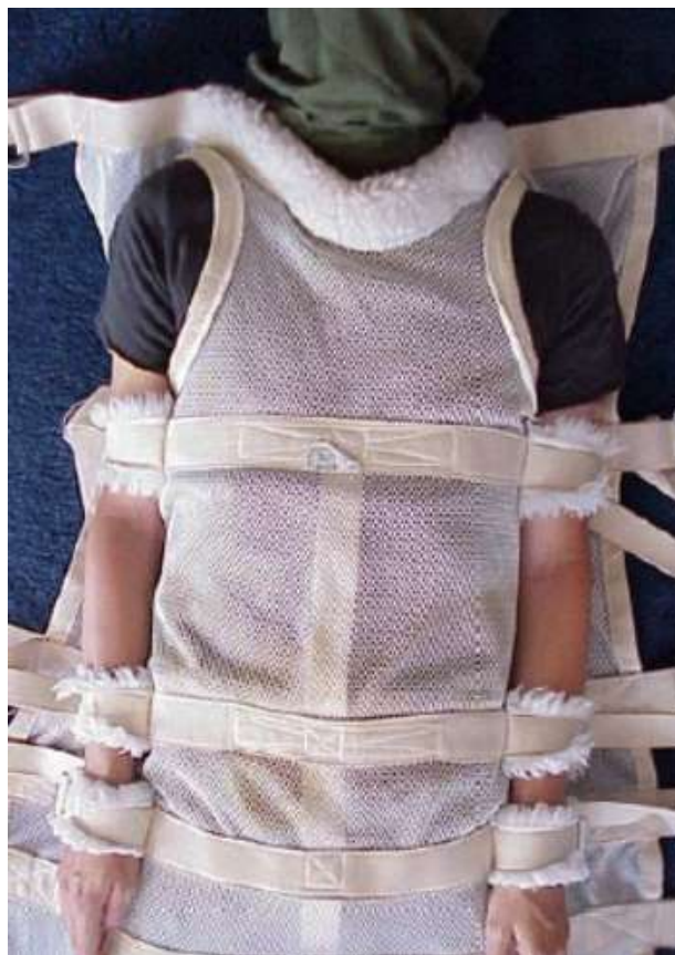
Figure 5:- Posey Vest.