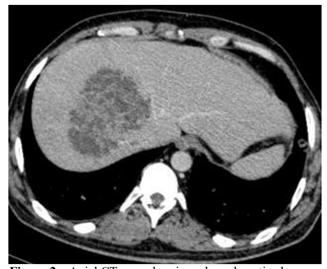
Figure 2:- Axial CT scan showing a large hepatic abscess.