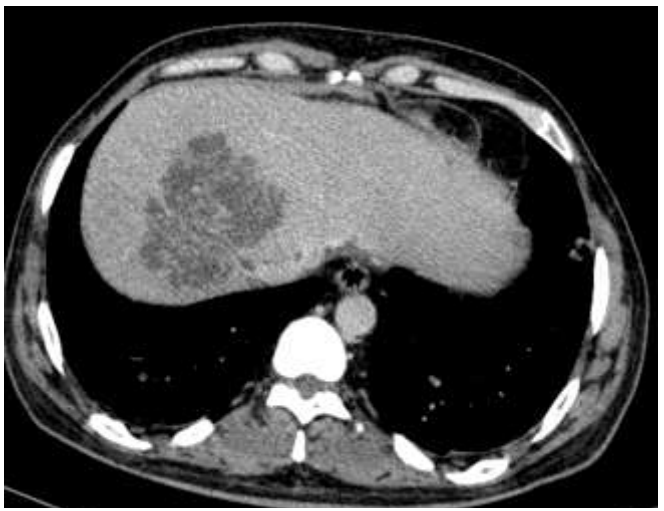
Figure 1:- Axial CT scan showing a large hepatic abscess.