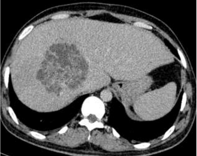
Figure 3:- Axial CT scan showing a large hepatic abscess.