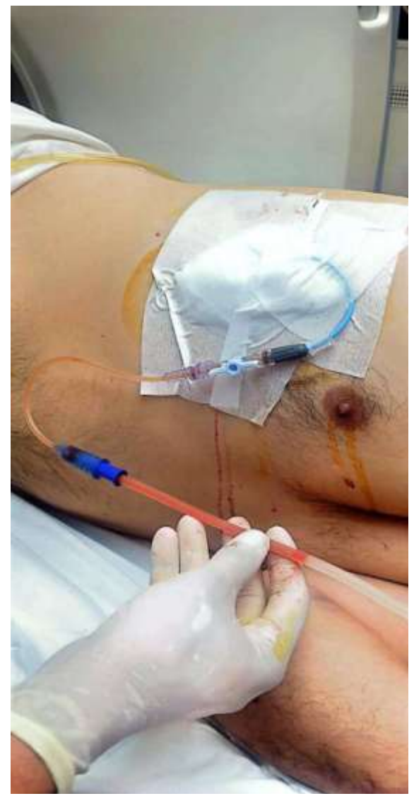
Figure 6:- Placement of a drain in the hepatic abscess.