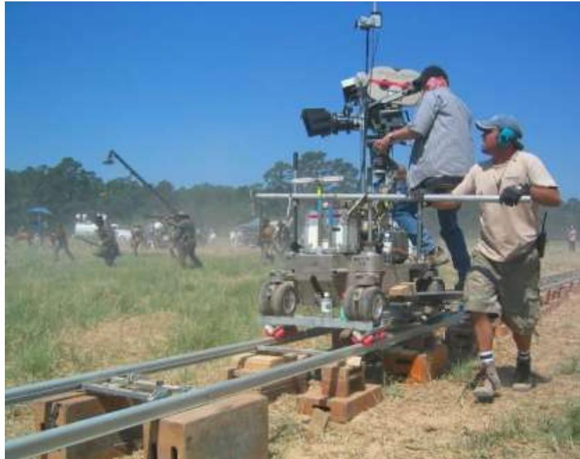
Figure 3:- Camera Movement.

The camera movement often emphasizes cultural context and emotional nuances. In Kabhi Khushi Kabhie Gham (2001) , sweeping camera movements in multiple family gatherings highlight the grandeur of Indian familial ties against the intimate close-ups that capture individual emotion. In Tumbbad (2018) , though slow and deliberate, camera movements emphasized the eerie feel of the film to allow the consumption of rich, dark visuals while bringing on foreboding and mystery. Crane shots are used in Lagaan (2001) to give the narrative more chances; they thereby make everyone realize how big the village is and how the characters have the spirit to unite against oppressors like the colonial forces.