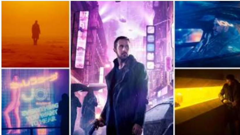
Figure 1:- Screenshot from the film 'Blade Runner 2049' (2017).

Furthermore, the manipulation of color can also be used to create visual contrasts and highlight key elements within a scene. By juxtaposing vibrant colors against muted tones or using color grading techniques to enhance certain hues, filmmakers can draw attention to specific details, create visual depth and enhance the overall visual impact of a film. Overall, color in cinema serves as a powerful form of semiotics that enriches the storytelling experience and engages audiences on a deeper level. Through the strategic use of color palettes, symbolism and visual contrasts, filmmakers can effectively convey complex emotions, themes and messages that resonate with viewers long after the credits roll.