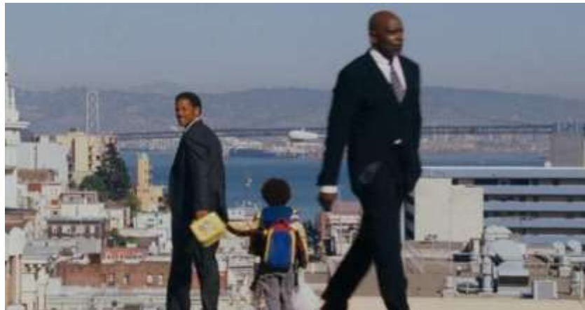
Figure 4:- Screenshot from the film 'In Pursuit of Happiness' (2006).

Personality is an important factor in visual narrative as it functions as a semiotic unit that reveals characters' traits, needs and conflicts to the audience. Directors always march beyond merely dialogue in their works by using both images and words even when attempting to imagine something as complex as relationships. For instance, in American cinema; the Iron Man (2008) character of Tony Stark possesses confidence, charisma and zeal to be subjugated as a leader and hero. On the other hand, George Costanza from Seinfeld (1989) is one of the straight supporting characters who portrays a weak and shy attitude hence providing comedy and a sense of being connected to the audience. Character traits are also an essential factor in the representation of the feelings of the person and in this case the inner conflicts of the character.