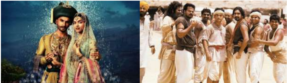
Figure 2 and 5:-Screenshots from the film 'Bajirao Mastani' (2015) and 'Lagaan' (2001).

Indian cinema makes use of traditional garb to project cultural identity and values. Simple, rustic apparel underscores their agrarian way of life and creates resilience against colonial oppression in Lagaan (2001). As this underlines the unity and shared problems in a community, Bajirao Mastani (2015) makes use of more elaborate costumes to reflect the characters' royal status and the rich cultural heritage of that period through the deeper layers of a love-rivalry narrative.