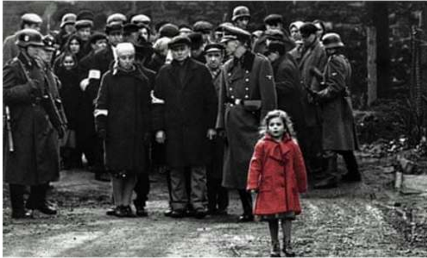
Figure 2:- Screenshot from the film 'Schindler's List' (1994).

primary functions of color in cinema is to establish a visual language that communicates specific themes or emotions. For example, warm colors such as reds and oranges are often used to evoke feelings of passion, love, or danger, while cool colors like blues and greens can create a sense of calmness, sadness, or mystery. By strategically incorporating different color palettes into a film, directors can effectively guide the audience's interpretation of the story and characters. In addition to conveying emotions, color can also be used to symbolize deeper themes or motifs within a film. For instance, the use of black and white cinematography in classic films like Casablanca (1942) or Schindler's List (1994) can symbolize moral ambiguity, nostalgia, or the passage of time. Similarly, the recurring use of a specific color throughout a film can serve as a visual motif that reinforces a central theme or character trait.