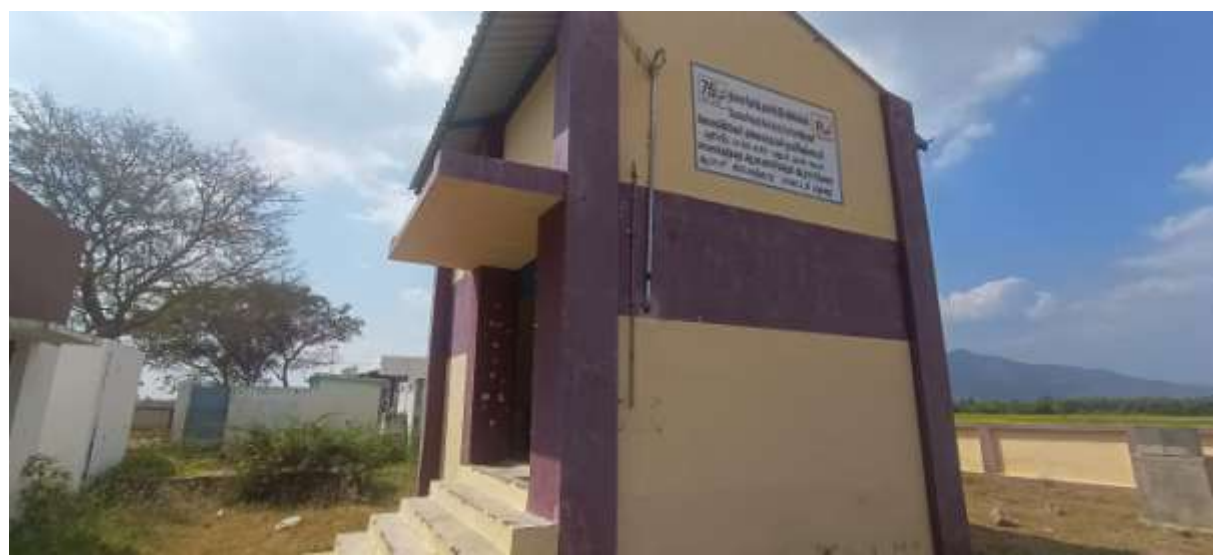
Figure 9:- Herbal Unit in Ambalathadi Panchayat, Madurai, lacking locks and proper compound walls for protection.