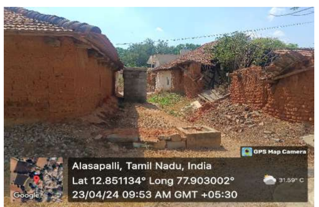
Figure 5:- Shows the houses near the Panchayat Office in Alasapalli, Krishnagiri.