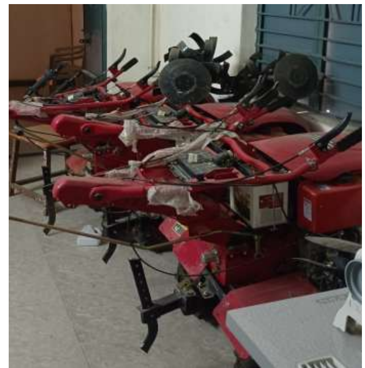
Figure 8:- Unused Agricultural Equipment's in Palathurai Panchayat, Coimbatore.