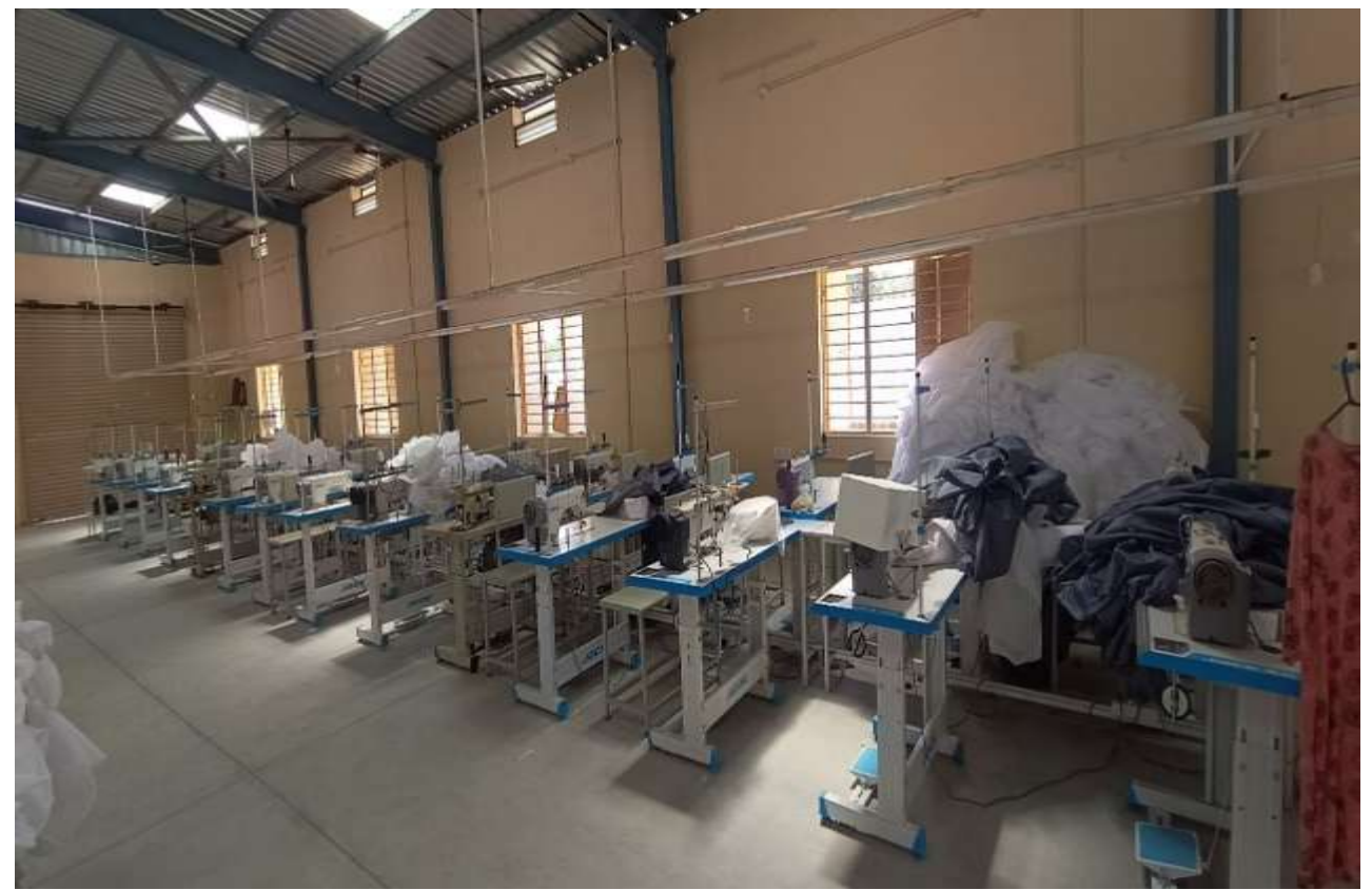
Figure 1:- Tailoring Unit, Krishnagiri.

SPMRM policy faces significant failures impacting its effectiveness and sustainability. These issues, ranging from inadequate business orders to lack of beneficiary engagement, underscore the critical need for effective policy implementation to ensure the program's success and support rural development. Below are a few major shortcomings collected from the research conducted across Tamil Nadu in the districts of Thiruvallur, Madurai, Coimbatore, and Krishnagiri, providing a detailed analysis of the policy's implementation challenges.