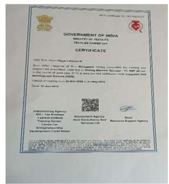
Figure 2:- Certificate of a Tailoring unit Respondent, Madurai.

humble businesses which are mostly run by women with limited knowledge in business management. Figure 1 indicates the picture of aTailoring Unit situated in the Krishnagiri district of Tamil Nadu.