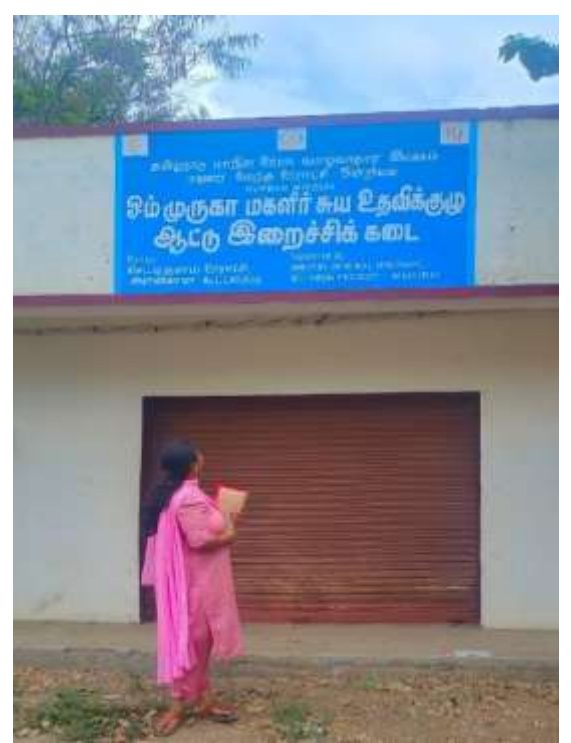
Figure 3:- Closed meat shop in Chettikulam Panchayat, Madurai.

The training given under SPMRM is often left without proper certification, which hinders the respondents while they search for jobs. The lack of a stipend discourages people from participating in these months-long training programs. Figure 2 indicates the picture of the 'Certificate' of a Tailoring Unit respondent belonging to the Madurai district of Tamil Nadu.