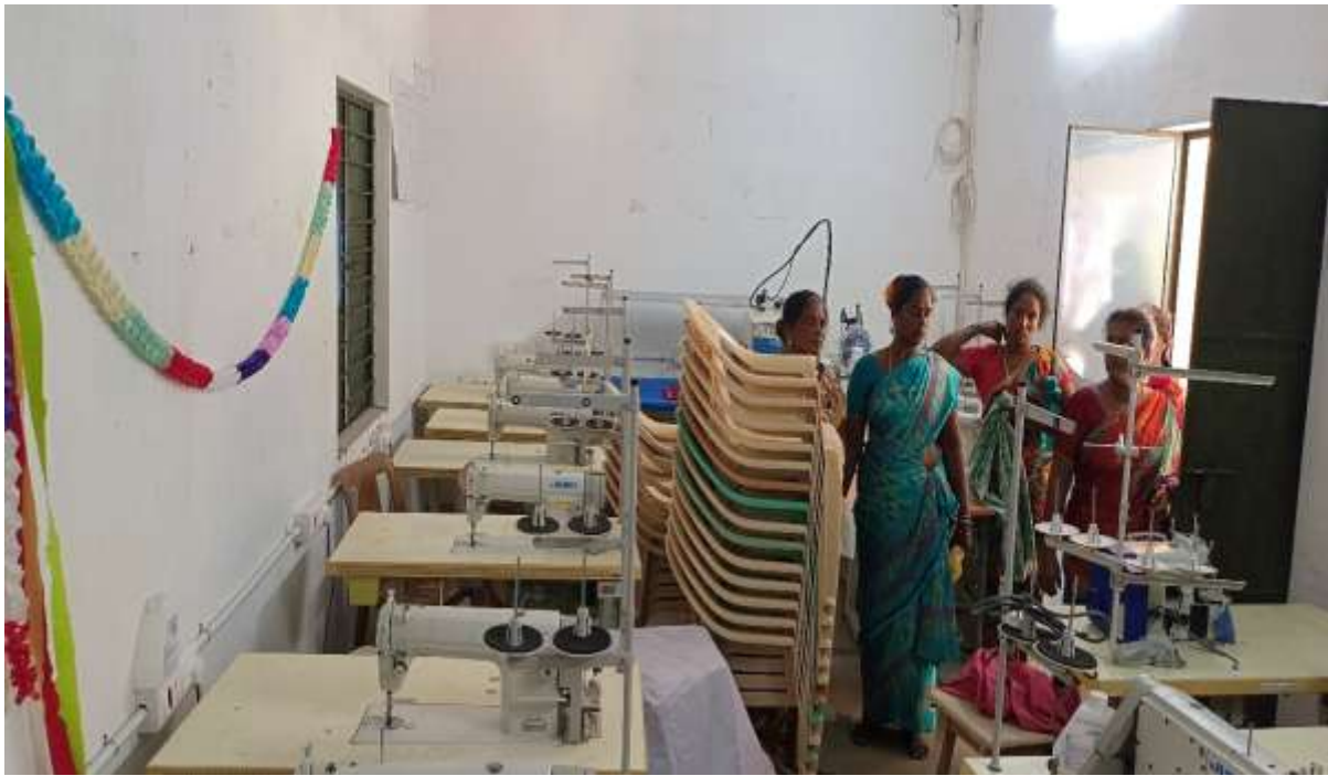
Figure 6:- Failed set up of a Tailoring Unit in Karunakarchery Panchayat, Thiruvallur.