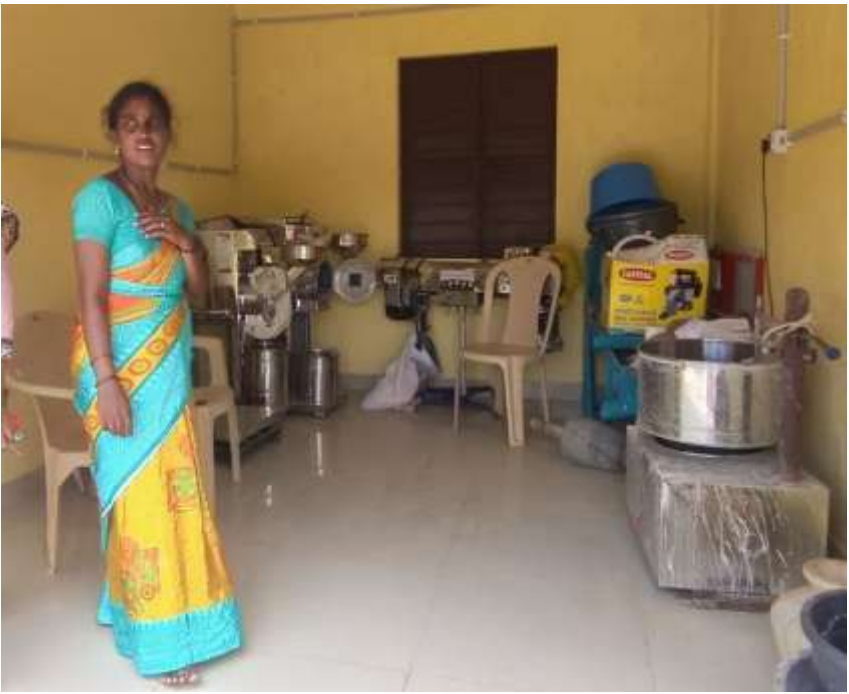
Figure 4:- Incomplete set up of a Flour Unit, Coimbatore.

The units running under SPMRM often face a money crisis when it comes to buying raw materials to initiate production, this slows down the business at a very early stage causing unemployment and unwillingness among respondents. Marachekku units, herbal products units, flour units, and canteen units are some of the units that are highly affected by this crisis. In the case of millet bakeries and Milk product units, these perishable goods face higher threats of loss when not used in due time. Figure 3 indicates the picture of a meat shop situated in the Chettikulam Panchayat of the Madurai district of Tamil Nadu, which was closed due to the lack of principal amount to buy the products required to run the meat shop.