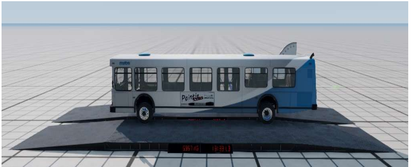
Figure 1.1b:- The image of the right side of the bus with the weighing scales.