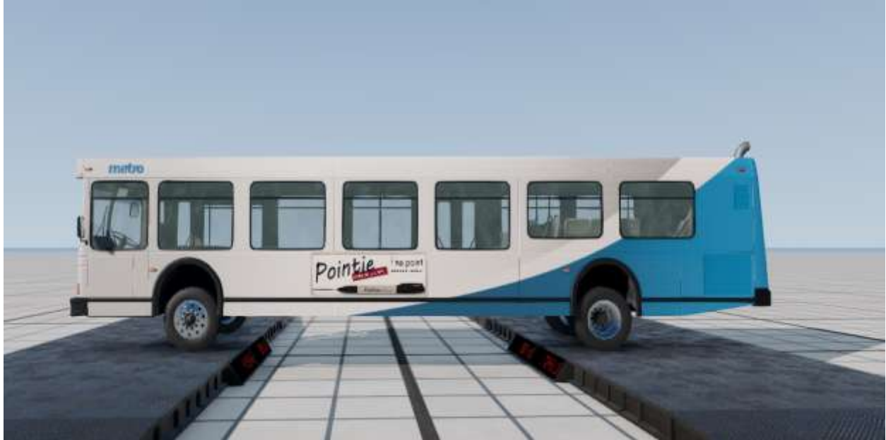
Figure 1.2a:- The image of the left side of the bus with the weighing scales.