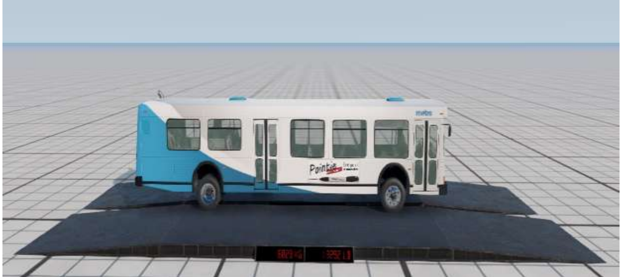
Figure 1.1a:- The image of the left side of the bus with the weighing scales.