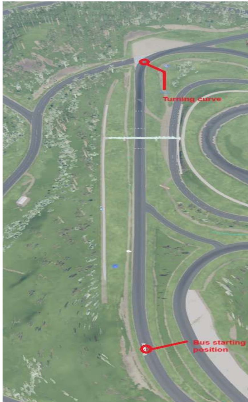
Fig 3:- Track Overview.