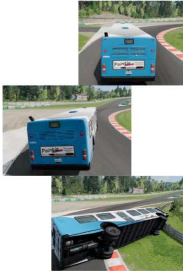
Fig 4:- A collage of the bus experiments.