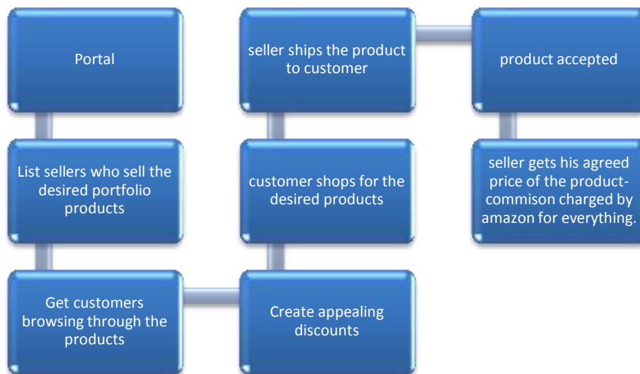
Figure 3:- showing workings of Amazon model

they do. Thus the core bread and butter of the Model is “X% commission on the total sale value given to the seller”. This model has been shown by the Figure 3.