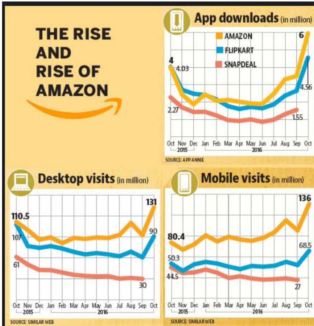
Figure 4:- showing the growth of Amazon India

After reading a report that in future web commerce will grow upto 2300%, Jeff Bezos selected about top 20 products to sell them online. After that he narrowed these products to 5 books, videos, computer software, hardware, and compact discs and then at last selected Books. This is result of good planning and innovative thinking. The result was just achieved in the first two month with sales rise up to $20,000/week.