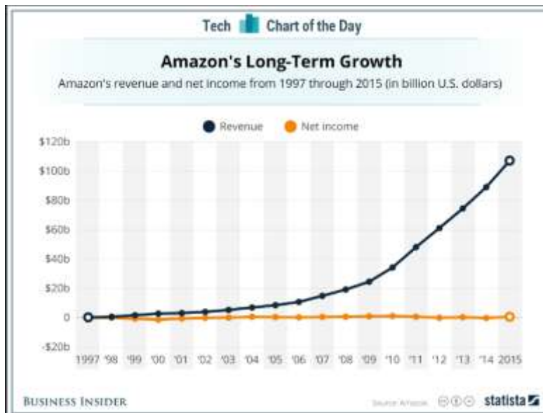
Figure 5:- showing the Revenues of Amazon India

Amazon started with bookstores, which soon converted to the top online retailer across the world, and currently, even though it has a lot of competition, Amazon has a strong base of customers who buy from the online retailer.