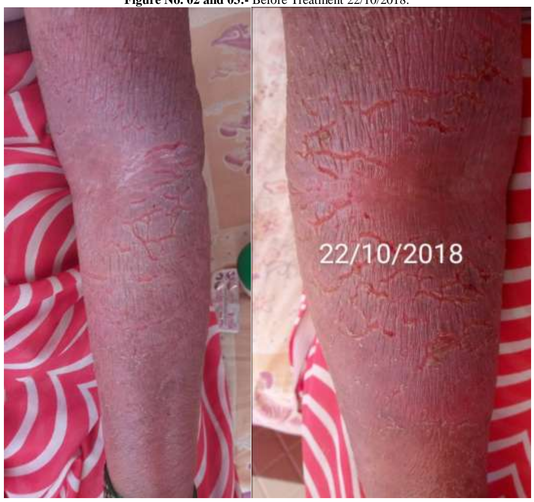
Figure No. 02 and 03:- Before Treatment 22/10/2018.