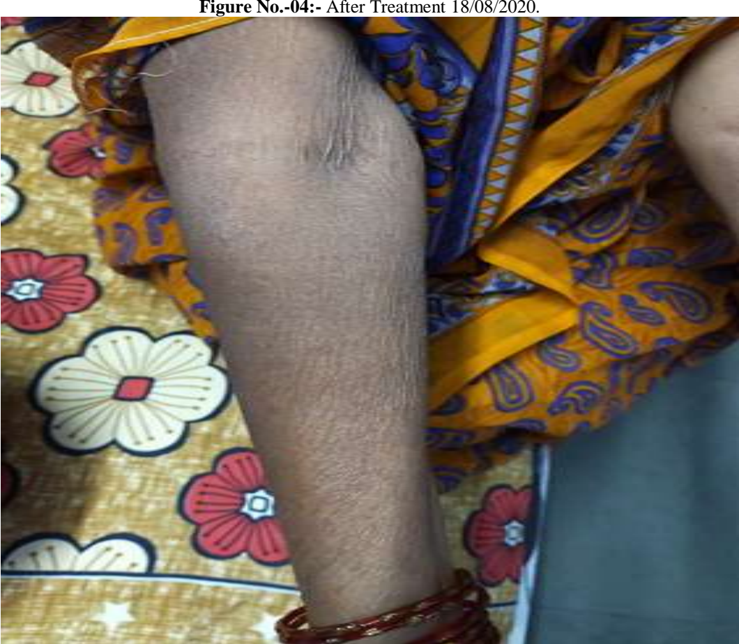
Figure No.-04:- After Treatment 18/08/2020.