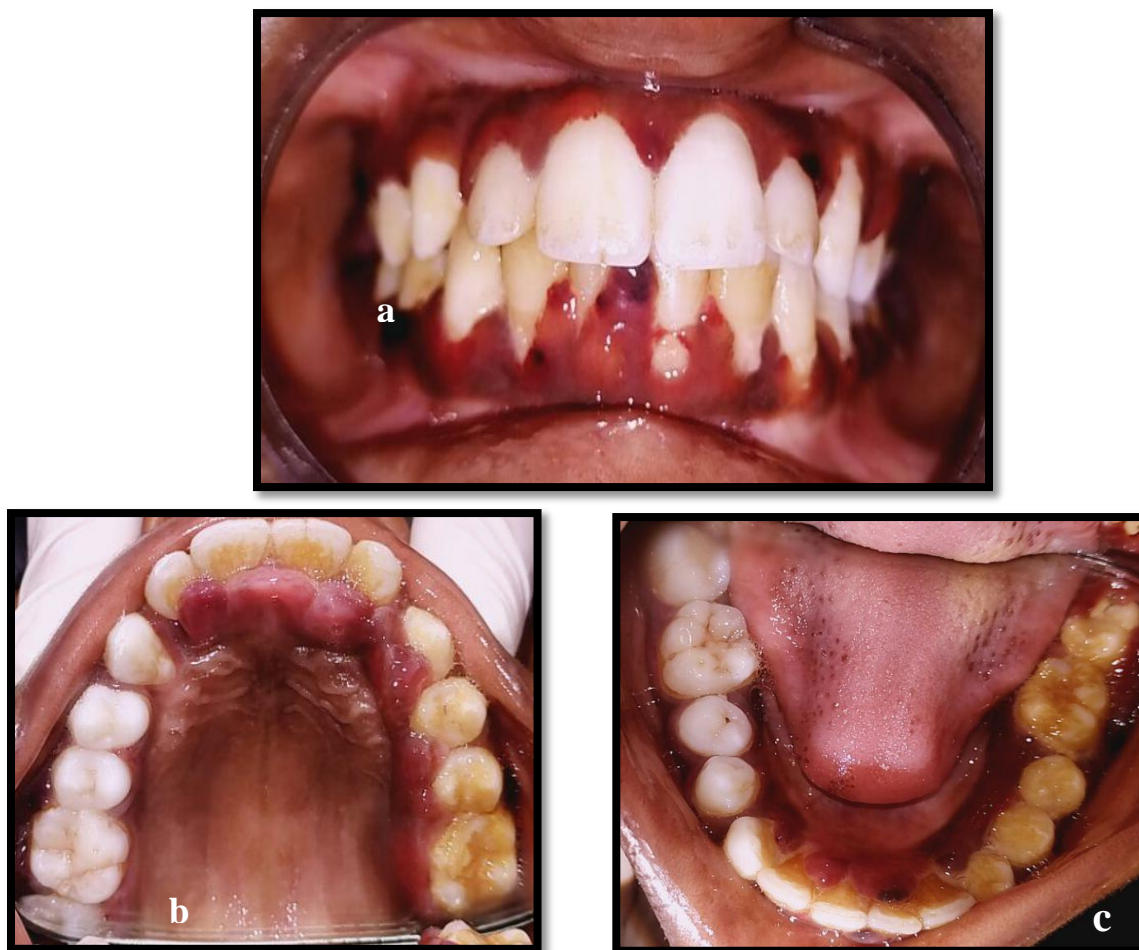
Fig. 1:- Preoperative Intraoral photographs showing gingival enlargement (a) Frontal view (b) Maxillary view (c) Mandibular view ]

An intra-oral examination revealed that gingiva was reddish, spongy, edematous, soft and friable with a smooth, shiny surface and tendency to bleed on probing. Diffuse type of grade II moderate gingival overgrowth involving interdental papilla, marginal and attached gingiva extend till cervical 1/3 rd of the teeth. Miller's Class II gingival recession irt 32, 41, 42. (Fig. 1).