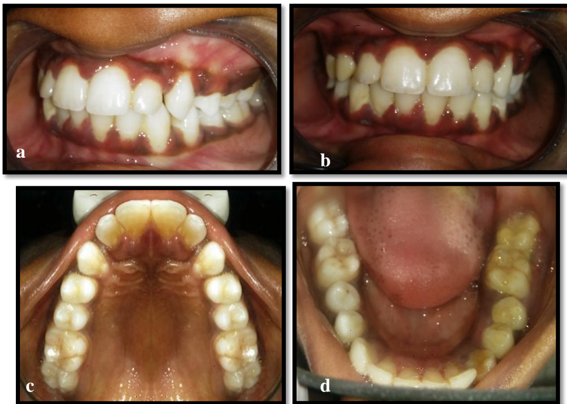
Fig. 3:- Postoperative Intraoral photographs after 15 days showing diminished gingival enlargement (a,b) Frontal view (c) Maxillary view (d) Mandibular view.

Incisional Biopsy taken for Histopathology investigation. Parakeratinized stratified squamous epithelium and hemorrhagic areas were seen. Subepithelially there was connective tissue infiltrated with inflammatory cells. Histopathological pictures were suggestive of chronic gingival hyperplasia.(Fig. 2)