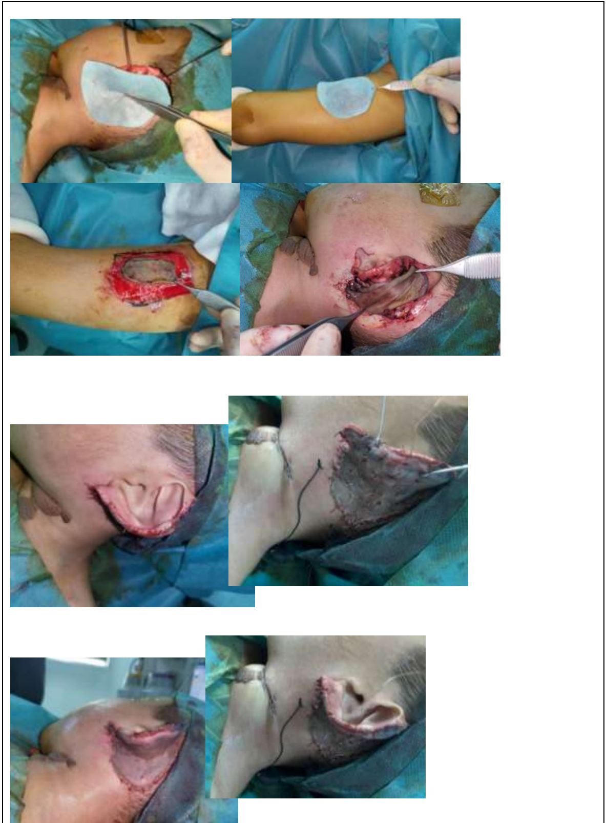
Figure 3:- Stages of skin grafting.