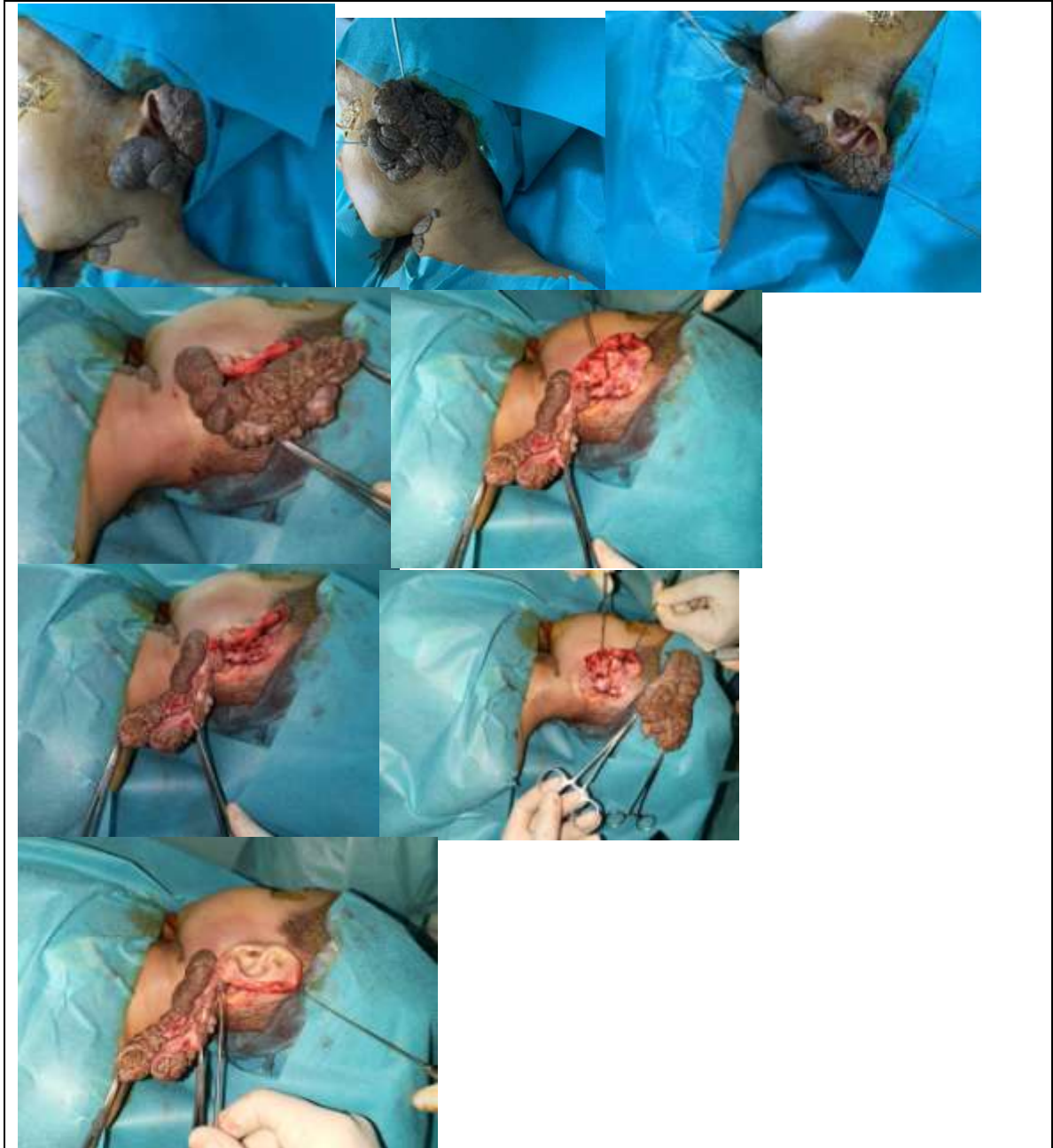
Figure 3:- Stages of tumor removal.

Finally, half of the cervical lesion was removed while respecting the tension lines, followed by careful tissue closure (Figure 5).