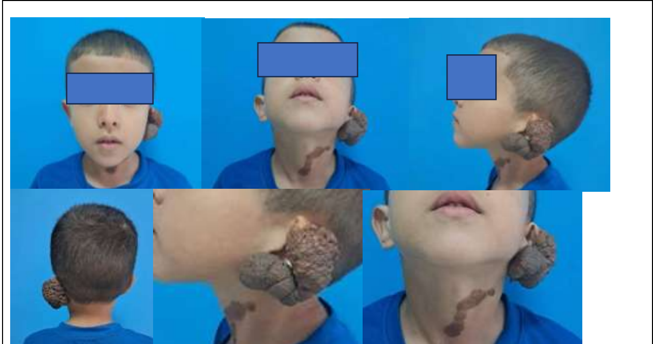
Figure 1:- Photographs of the patient at the pre-operative consultation.

A cervicofacial CT scan (Figure 2) was performed and confirmed a diffuse thickening of the left auricle, responsible for a narrowing of the external auditory canal, with no suspicious bone involvement. Based on these findings, the patient was diagnosed with a hamartoma of the left ear.