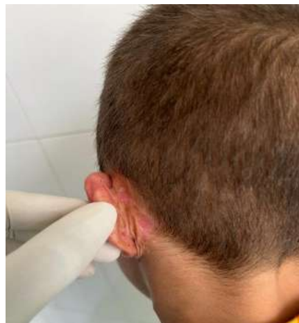
Figure 7:- Results at 6 month postoperative.