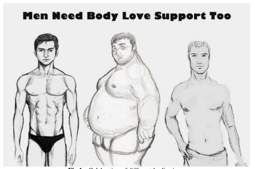
Fig 1:- Celebration of different bodies inmen.

By tackling this problem, we move closer to establishing a more accepting and kind society in which each person's experiences and body are acknowledged and appreciated. Society's perceptions of what makes a man physically appealing have evolved significantly over time. When it comes to altering masculinity and body positivity, men confront several challenges. Due to the pressure they feel touphold the standards of toughness, they may be unwilling to seek treatment for mental health issues or to admit their vulnerabilities. Furthermore, these problems are frequently stigmatized, which can lead males to feel alone. We must foster a more accepting atmosphere where guys feel at ease discussing their experiences and expressing their feelings in order to solve these issues. We must also dispel inaccurate ideas about masculinity. We hope to become a society where all the bodies are appreciated and celebrated. We hope the findings we preach through this paper about heightened body concerns in men can be solved and dissatisfaction in one's body becomes a distant thought.