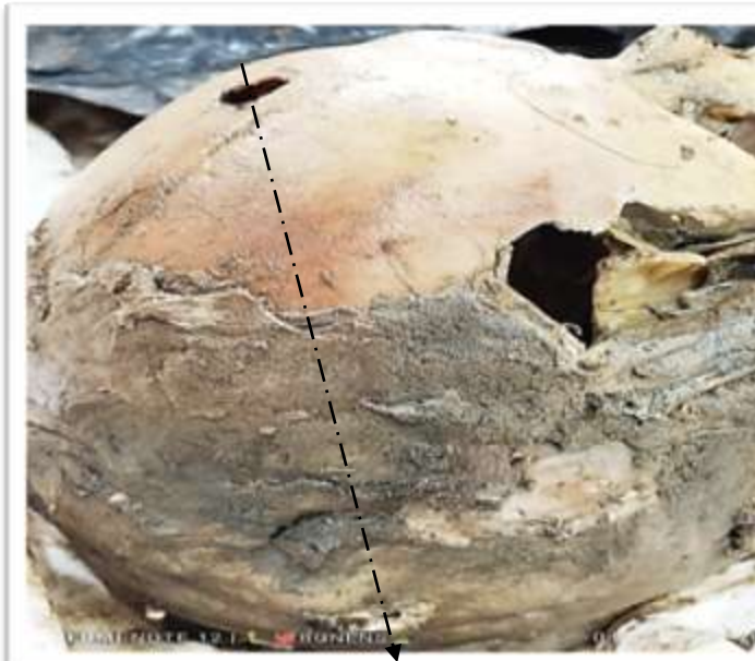
Figure 5:- Direction of the bullet (backwards, downwards, right side)