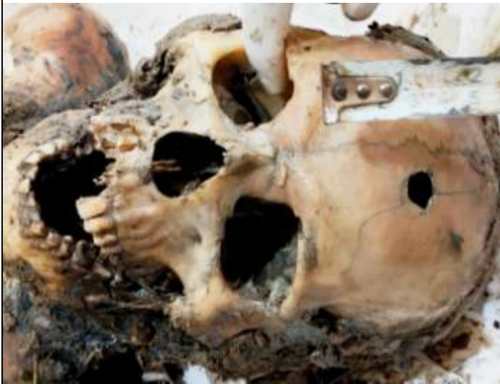
Figure 3:- Entry wound on left frontal bone.