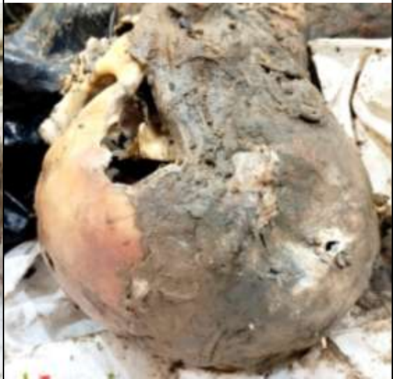
Figure 4:- Exit wound on the right parietal bone.