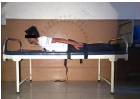
Fig.1 The above figure shows the active extension of thoraco-lumbar spine with shadow goniometer.