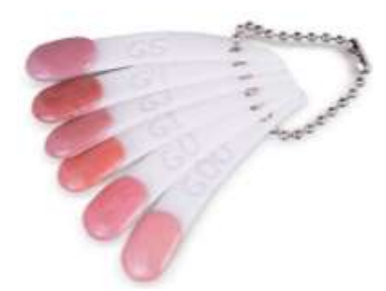
Fig.1:- BruxZir Gingival Shade Guide with G00, G1, G3, G4, G5 shades.

G00 (Lightest), G0 (Light), G1 (Standard), G3 (Medium), G4 (Dark) and G5 (Darkest).