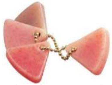
Fig.2:- Lucitone 199 Shade guide system (Dentsply Trubyte, York, Pa).

The Lucitone 199 shade guide system (Dentsply Trubyte, York, Pa) consists of 4 glossy shade tabs of the same shape in original, light, light reddish pink, and dark shades.