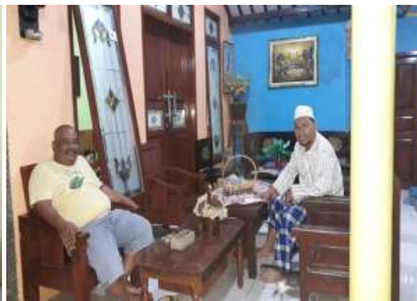
Interview with the Chairperson of BPD in Pleret Village

The draft text of the Village Regulation on the Village Budget and Expenditure (APBDesa) which was prepared by the Village secretary was submitted by the Village Secretary to the Chairperson of the Badan Permusyawaratan Desa. The Chairperson of the Badan Permusyawaratan Desa (BPD) after receiving the draft text of the Village Regulation draft on the Village Revenue and Expenditure Budget (APBDesa) discussed the Village Regulation Draft on the Village Revenue and Expenditure Budget between the chairman and Members of the Badan Permusyawaratan Desa (BPD) with the Village Government (Village Head and Village Apparatus) as an element of the Village Government in the Pre Discussion Meeting of the Village Regulation Draft on Village Budgeting and Expenditure to be stipulated as a Village Regulation.