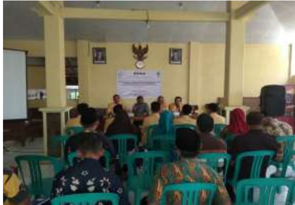
Field Study and Interview with the Head of Pleret Village