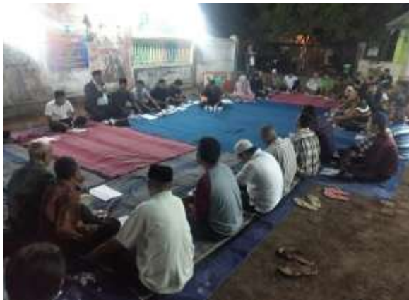
Hamlet Deliberation at PLERET Village

and the Badan Permusyawaratan Desa then the Village Regulation on the Village Budget and Revenue (Perdes APBDesa) was announced in the village news and recorded in the village sheet by the Village Secretary.