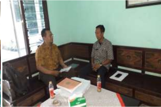
Interview with the Secretary of the Pleret Village