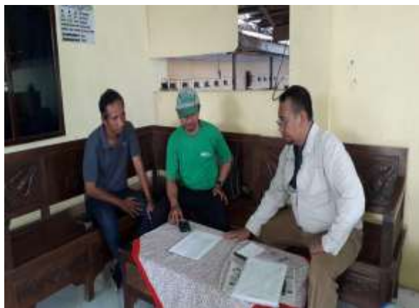
Interview with Kaseret Pleret Village