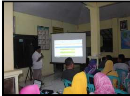
Village development planning deliberation (musrenbangdes) in pleret village.

The Pleret village development planning deliberation ( Musrenbangdes ) for the 2020 budget year was held in October 2019 led by the Chair of the Badan Permusyawaratan Desa (BPD) attended by the Village Head, Village Secretary, Village Official, Hamlet Head, Chair and members of the Badan Permusyawaratan Desa/ BPD, Community Leaders, Religious Leaders, Youth / Youth Leaders, LPM Management, PKK Management, POSYANDU Management, Garbage Bank Management, Binta Village Trustees (BABINSA) Pleret Village from the Pohjentrek Koramil.