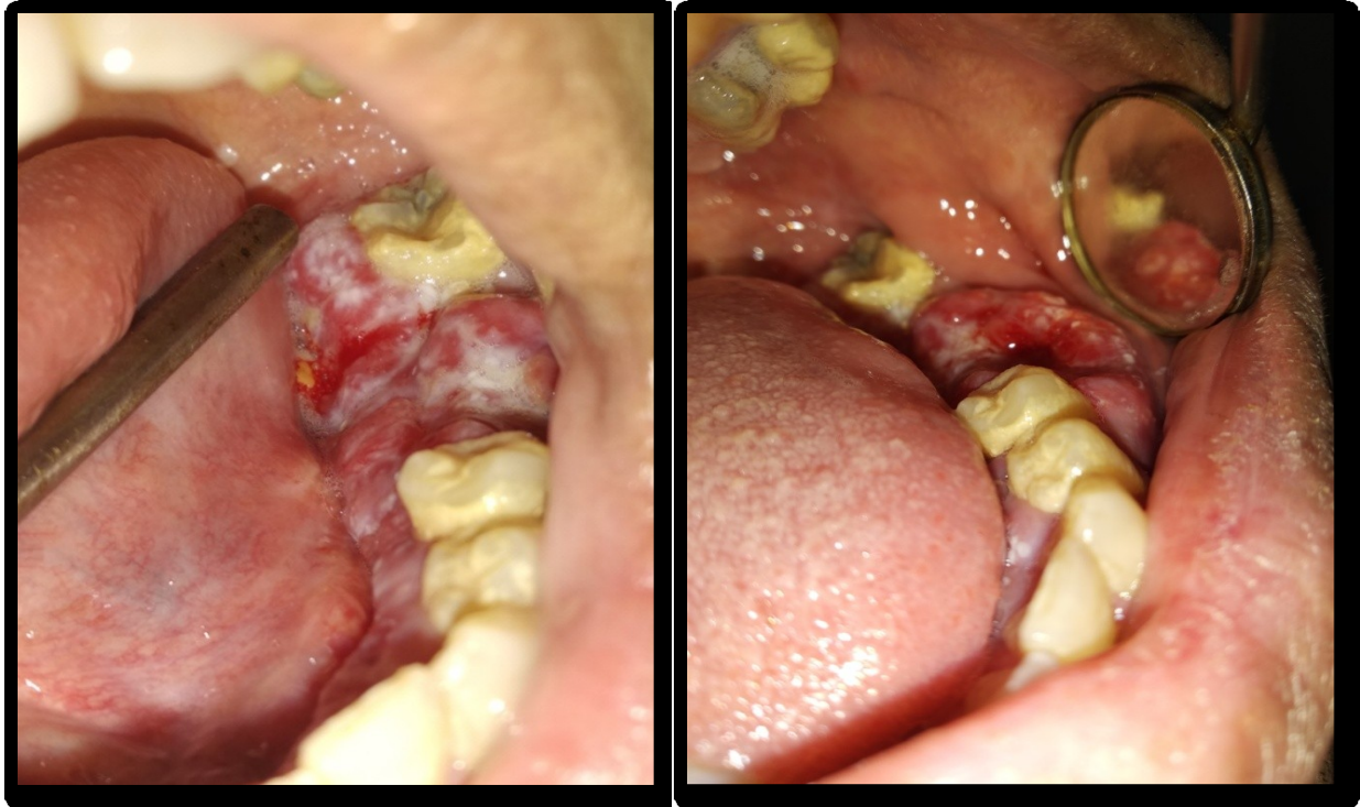
Fig 1:- Intraoral picture depicts proliferative growth involving the gingiva, alveolar mucosa and sulcus extending from 35 to 38 region on both the buccal and lingual aspect.