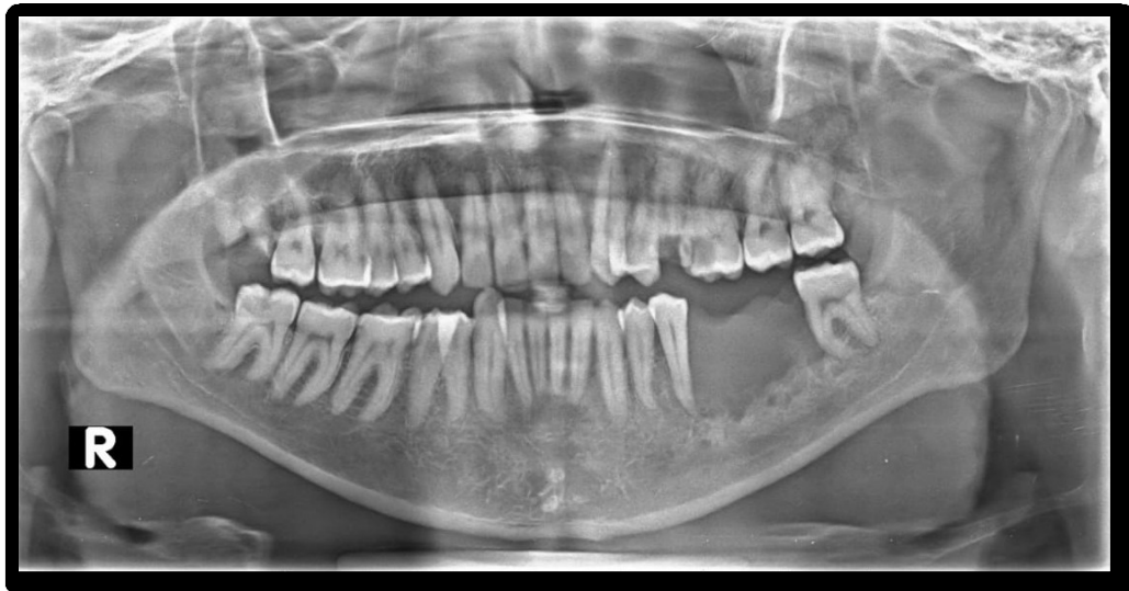
Fig 2:- OPG revealed a diffuse radiolucency with ragged borders in the left body of the mandible extending antero-posteriorly, from distal aspect of 35 to mesial aspect of 38 and superoinferiorly, from the alveolar crest of 35 and 38 to 2cms inferiorly.