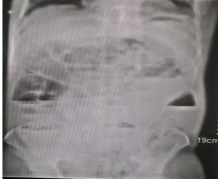
Figure 2:- X-Ray Erect abdomen showed multiple air fluid level suggestive of obstruction.