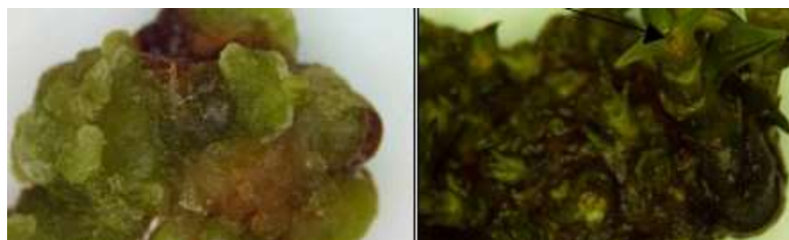
(a) Callus From Leaves (B) Shoot From Seeds