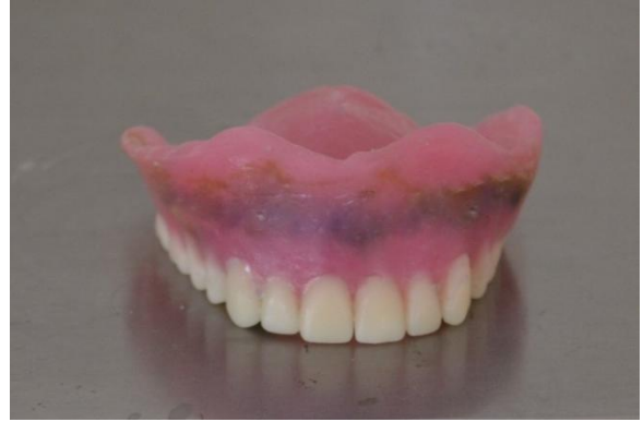
Figure 7:- Processed denture with sugar pumice mixture.