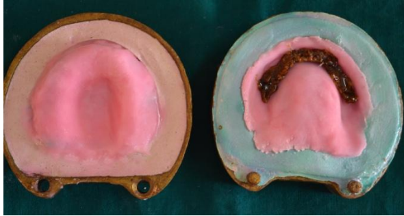
Figure 6:- sugar pumice mixture is placed in the flask containing teeth and sandwiched between two layers of acrylic dough.