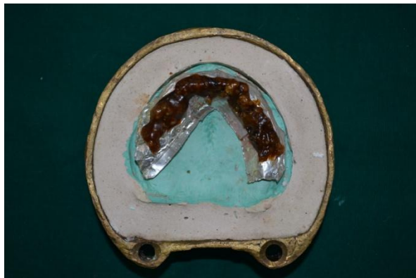
Figure 3:- sugar pumice mixture caramelized and placed carefully on the aluminum foil.