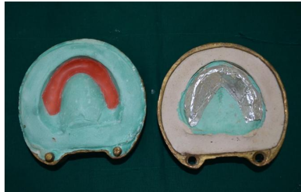
Figure 2:- Two layers of aluminum foil on the cast side of the flask and one layer of wax sheet placed on the counter flask containing teeth