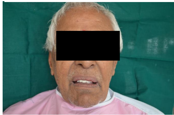
Figure 9:- Post insertion photograph.