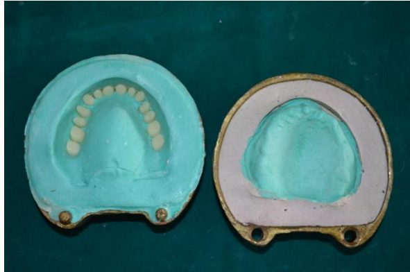
Figure 1:- Dewaxed moulds