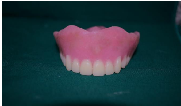
Figure 8:- After removal of pumice sugar mix.