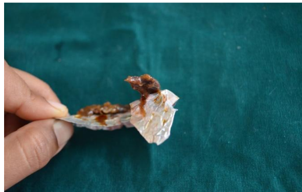
Figure 4:- Aluminum foil peeled off from the set sugar pumice mixture