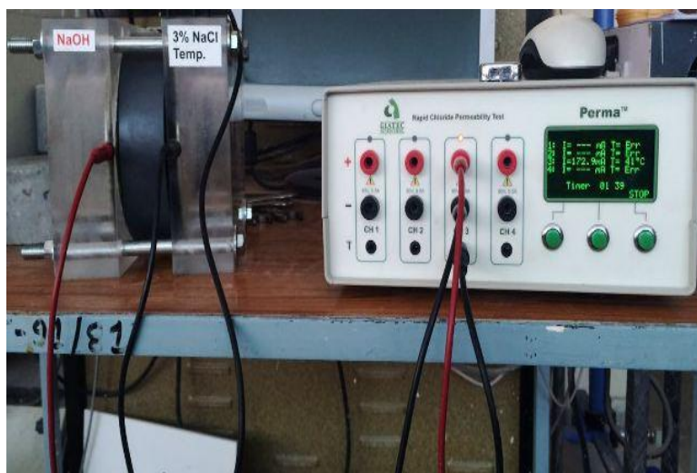
Figure 3:- RCPT apparatus