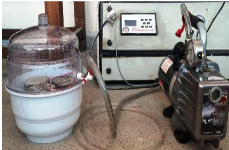
Figure 2:- Vacuum desiccator