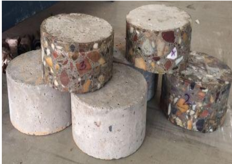
Figure 1:- Test specimens.