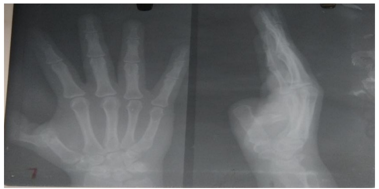
Figure 1:- Left thumb anteroposterior (A) and lateral (B) radiographs at presentation demonstrating a complex complete dorsally dislocated metacarpophalangeal joint. Note the excessively widened metacarpophalangeal joint space and possible sesamoid bone within the joint space on the lateral x-ray.

A new x-ray was taken at this time in the clinic, confirming a persistent complete dorsal dislocation of the thumb MP joint (Figure 1). Detailed inspection of the x-ray revealed possible signs of entrapped structures within the joint. The joint space was significantly widened.