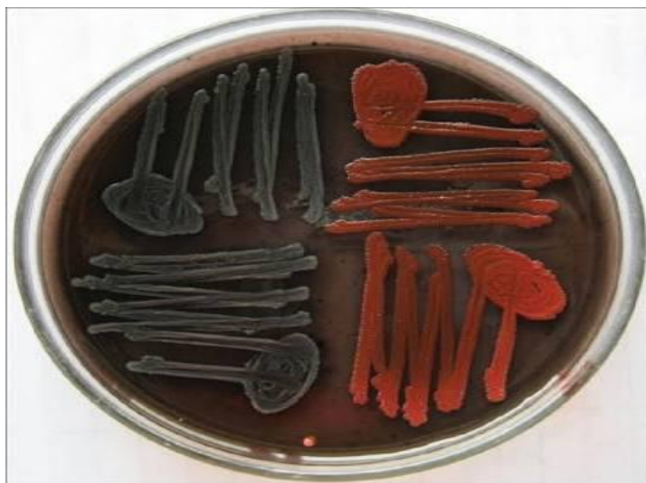
Fig 2:- Biofilm formation by Candida species (Congo Red Agar)

Congo Red Agar (CRA) is a simple and qualitative method for detecting biofilm production described by Freeman et al using Congo Red Agar medium. CRA medium was prepared with brain heart infusion broth 37 g/L, sucrose 50 g/L, agar No. 1 10 g/L and Congo Red indicator 8 g/L. Firstly Congo red stain was prepared as a concentrated aqueous solution separately from the other medium constituents and autoclaved at (121°C for 15 minutes) and then added to the autoclaved brain heart infusion agar with sucrose which is cooled at 55 °C. CRA plates were inoculated with test organisms and incubated at 37 °C for 24 hr aerobically. Black colonies with a dry crystalline consistency will indicate biofilm production. The experiment was performed in triplicate and repeated three times.