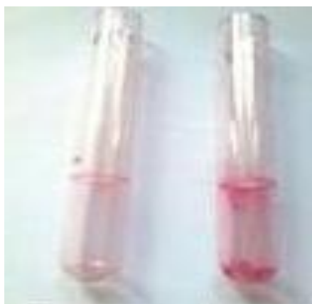
Fig 3:- Biofilm formation by Candida species (Tube method)

A loopful of organisms from the surface of SDA plate was inoculated into tube containing 10ml of Sabouraud Dextrose Broth supplemented with glucose. The tubes were incubated at 35°C for 48hours. After incubation, the culture supernatants were decanted and the tubes were washed with phosphate buffer saline (pH 7.3) and the dried tubes were stained with 1% Safranin. Excess stain was removed by washing with de-ionized water. Tubes were then dried by positioning them invertedly. Tubes were then observed for biofilm formation. Biofilm formation was considered positive when a visible film lined the wall of the test tube.