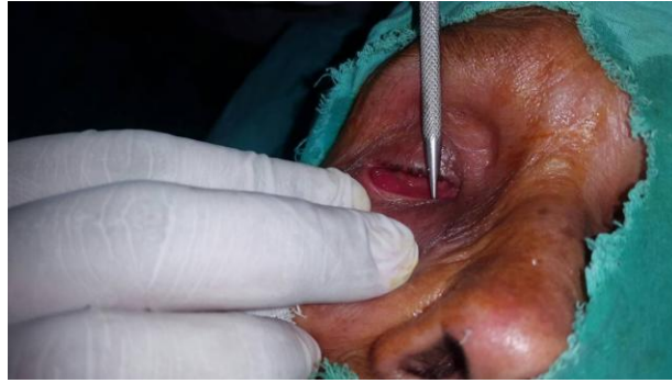
Fig-2:- Punctum was dilated with punctum dilator.