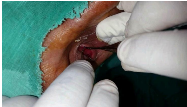
Fig 3:- 3 snip punctoplasty was done