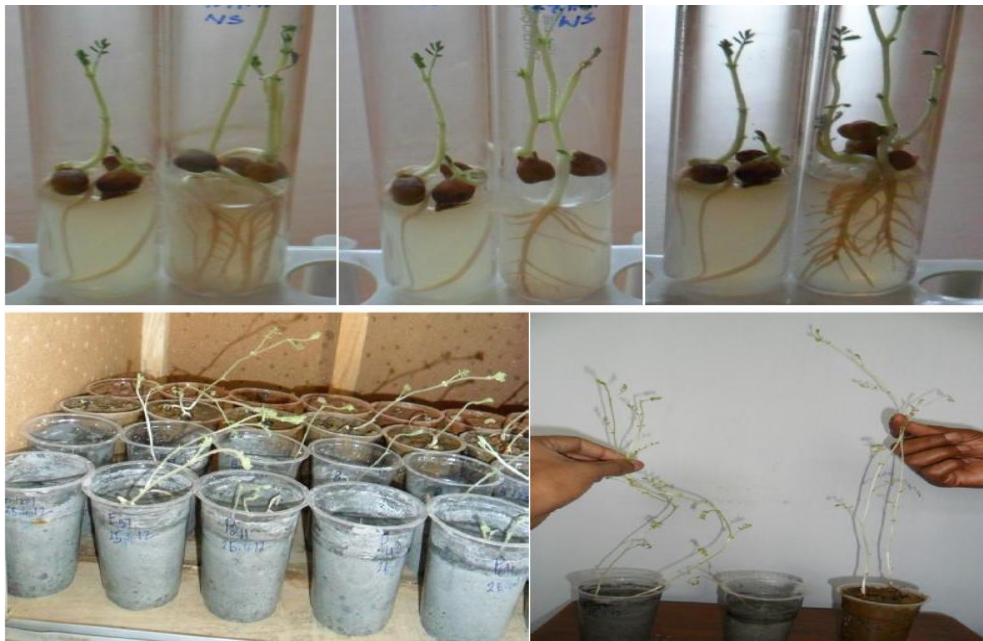
Figure 3:- After 3 rd week bacterial isolates plant growth promoting and seed germination on water agar media and fly ash containing soil.

Plant growth promoting effects and seed germination of plant was carried out on water agar media and fly ash containing soil and the results are shown in the given (Figures 3). After 3 rd week the maximum plant growth was occurred. More experimental studies are required to verify the same results for other plants like rabi crop or large plants like mango, jackfruit, guava, banana etc. that can grow on fly-ash and produce flowers and fruits. Other types of cattle-dung can also be used for above experiments. So this is one of the best way to utilize fly-ash to solve the environmental problem.