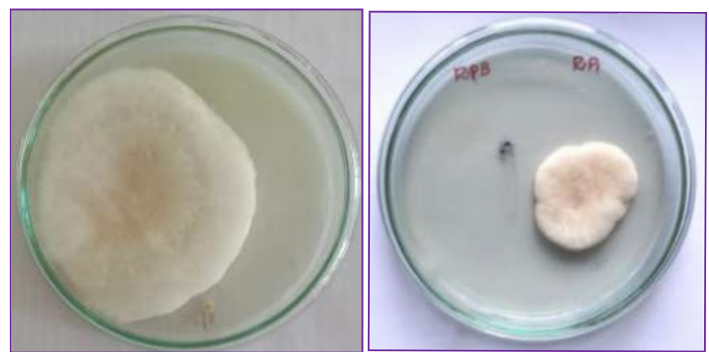
Fig. 4:-Antagonistic effect of RPB against Fusarium sp. along with its control