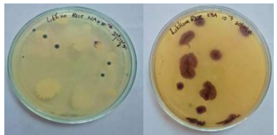
Fig. 1:- Isolation of rhizosphere bacteria from soil.

The bacterial colonies were isolated in Nutrient Agar and King'sB Agar medium. After 24 hours of incubation in the room temperature the colonies were subjected to grow on the culture plates (Fig. 1). The majority of the colonies (almost 70%) obtained are white, creamy coloured and some are pigmented in nature. From among the various colonies formed after incubation, a purple pigmented colony named as RPB (Rhizosphere Purple Bacteria) were selected, purified and used for further studies (Fig. 2).