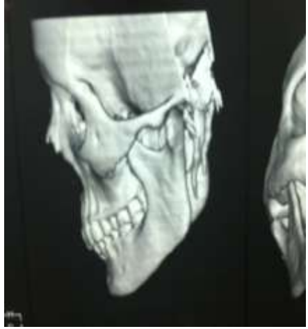
Figure 2:- 3D reconstruction of CT scan showing spatial orientation of bilateral elongated styloid process