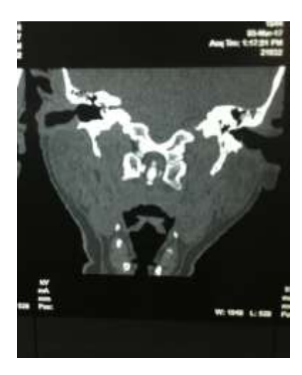
Figure 1:- CT scan slice showing bilateral elongated styloid process(left >right)

vicryl. Histopathology report of tonsil specimens showed features of tonsillar cyst on left side and chronic tonsillitis on right side. Post operatively the patient was relieved of pain.