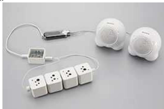
Fig.3 An Mp3 powered battery

Lim and Pal more at the Brown University have reported a micro fluidic BFC with many channels connected in parallel. In this configuration, the design allows streams of fuel and oxidant to flow in parallel within a micro channel without using a membrane as a separator and showing a power density >25 \text{ uW/sqcm} . Several potential applications of BFCs have been reported or proposed in the literature for implantable devices, remote sensing and communication devices as a sustainable and renewable power source. However, there are no BFC design formats or templates that allow for the production of a working device with a size on the order of 1cc, which are needed for several "real world" applications.