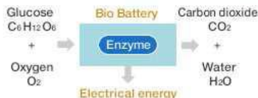
Fig.4 working of a Bio Battery