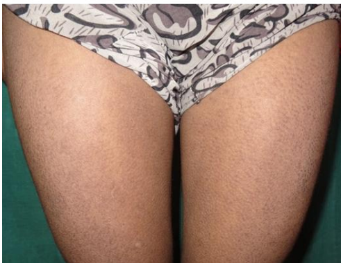
Fig. 3 symmetrical warty papules