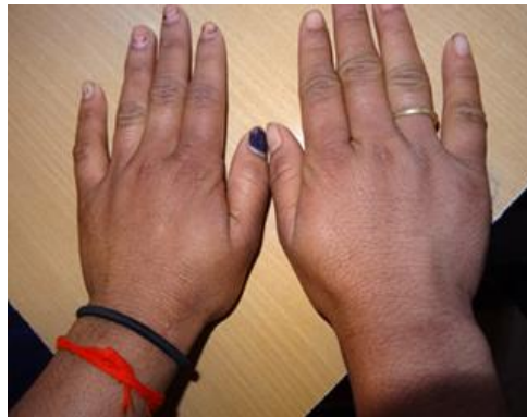
Fig.4 showing few warty papules over the dorsum of right lateral side of hand