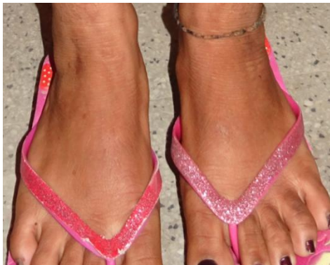
Fig.5 showing no involvement of feet