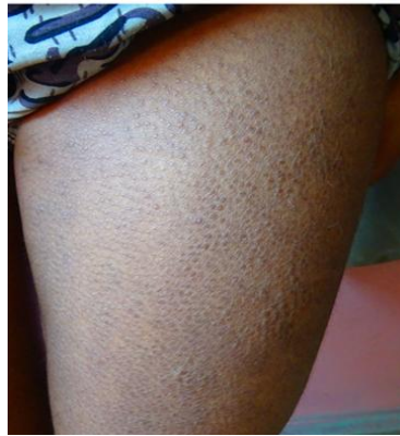
Fig.2 showing flat-topped warty papules